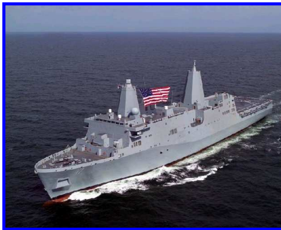
Notice the two Twin Towers on top of the ship.

The ship's motto stands today as, "They knocked us down. They can't keep us down. We're going to be back. Never forget."